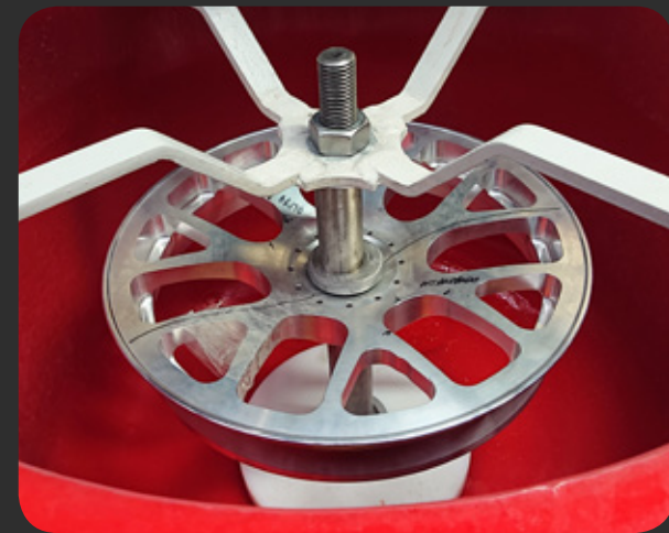
Automotive wheel before the finishing process