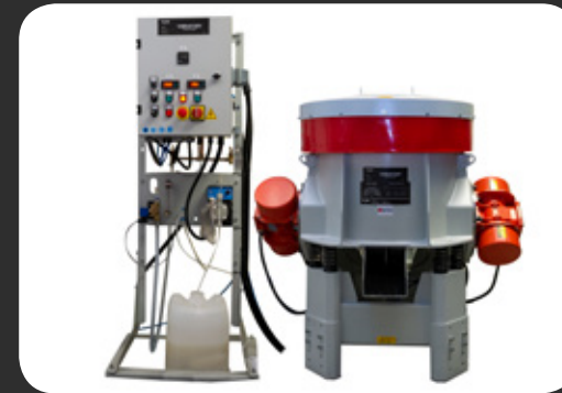
AWP188 wheel polishing system