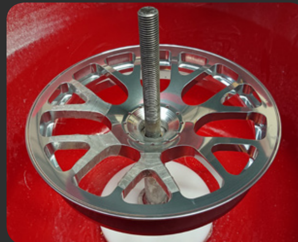
Automotive wheel after the finishing process in AWP188